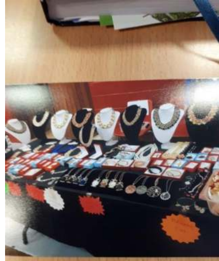
Indoor Market- example of stall