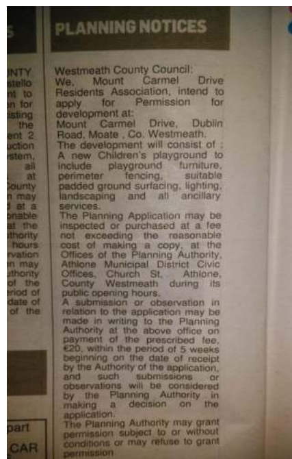
Planning Permission finally granted for Playground (leader project)