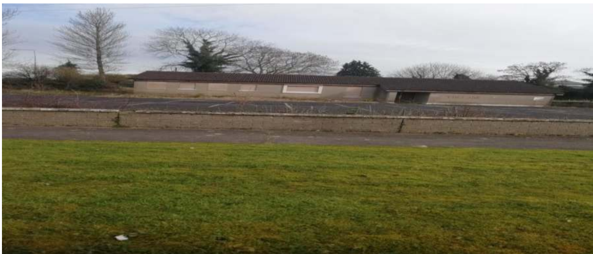
Old Teagasc building at top of estate- a work in progress