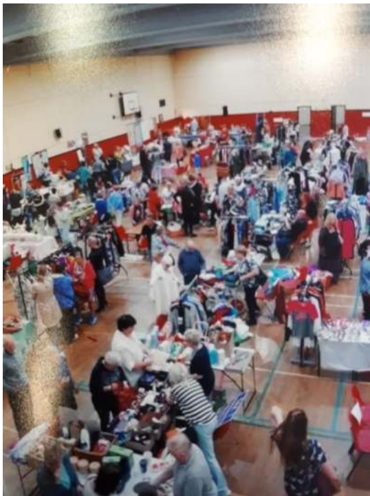
Indoor Market - Ariel View