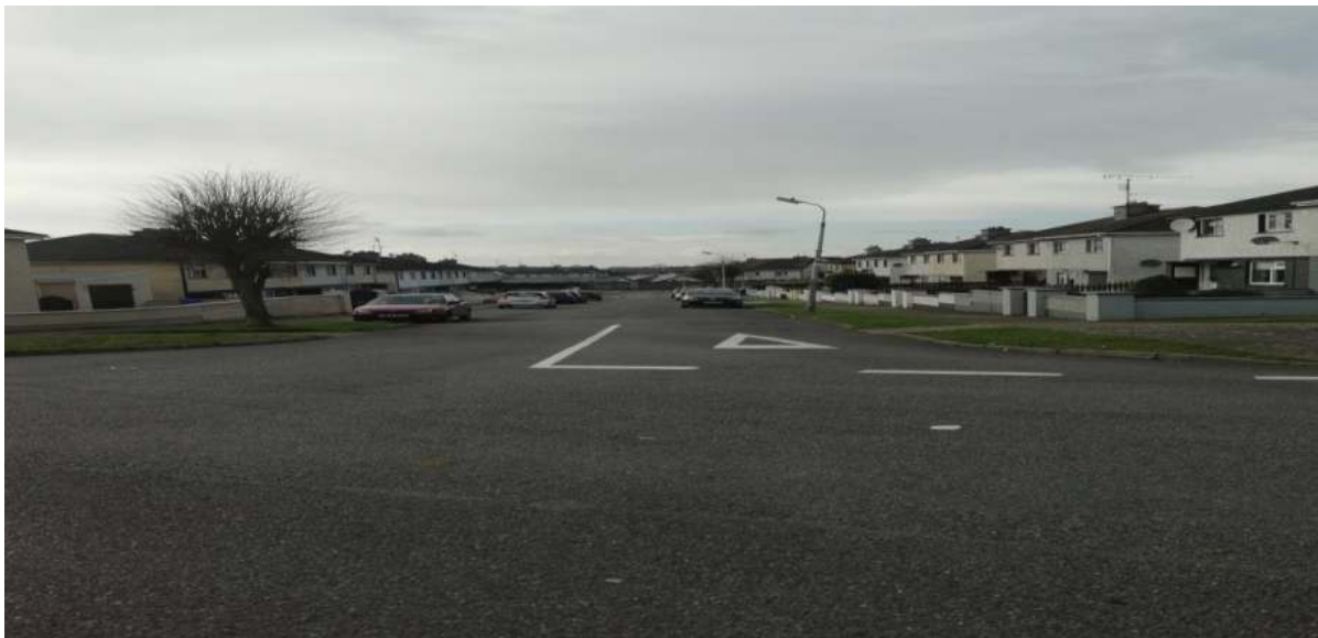
Entrance to Mount Carmel Drive

Context: Westmeath LCDC included Mount Carmel estate as part of the emerging needs category along with other local authority areas chosen which formed, Action 1 “pre-development in rural areas” of the Westmeath SICAP plan under Goal 1. The area is located on the right hand side off the Dublin road as you leave Moate going to Dublin. It comprises mainly families and includes 42 houses. It was built between 1979/1980.