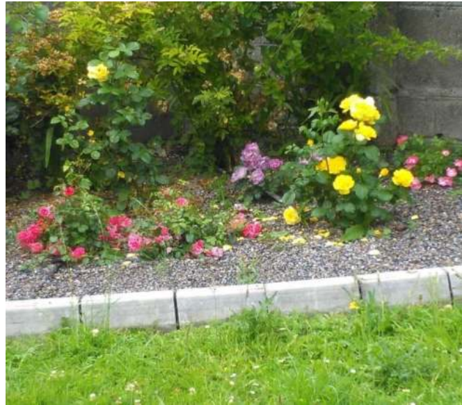
Examples of flowers sown with SICAP Grant