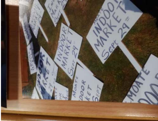
Indoor Market advertising